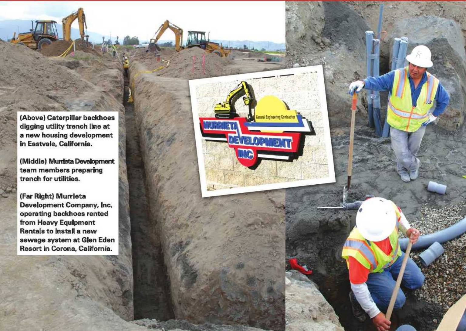
(Above) Caterpillar backhoes digging utility trench line at a new housing development in Eastvale, California.

maintain a very respectful fleet of excavators, backhoes, dozers, and wheel loaders. When their fleet is being fully utilized, they turn to Heavy Equipment Rentals (HER) in Corona, California. HER has been providing contractors with heavy bare equipment rental services since 1999 and they have worked with Murrieta Development since the beginning. Tracy Meeks explains, "We own several 420 and 430 Cat backhoes, 330 and 345 excavators, D5 and D6 dozers and 950 wheel loaders. If a job demands more equipment than we currently own, we call HER. We rent it and return it when we are done, all without that additional huge monthly payment, insurance and other liabilities that go along with owning equipment. On the Glen Eden and KB Home jobs, we